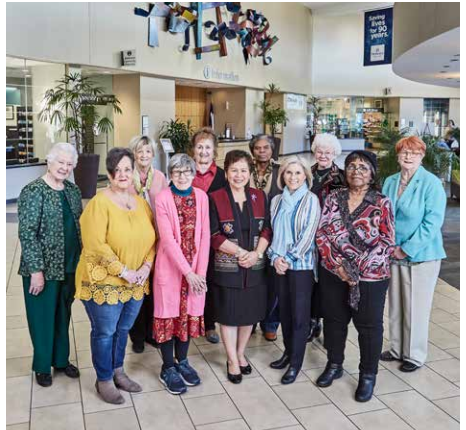
The 2019-20 Methodist Dallas Medical Center Auxiliary Board of Directors