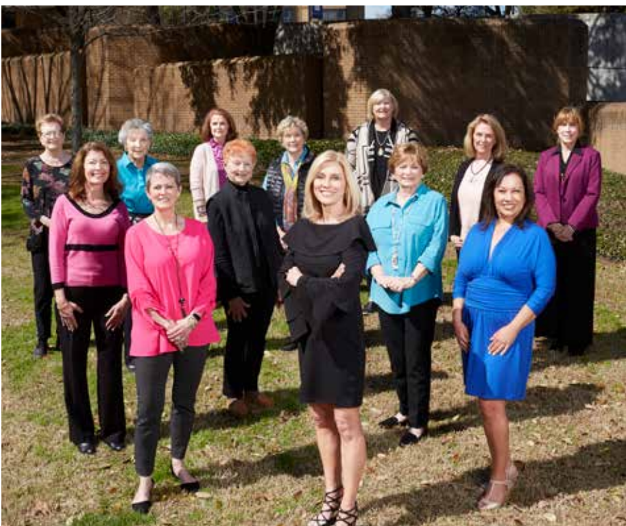
The 2019-20 Methodist Hospitals of Dallas Guild Board of Directors

Let’s take a look back at the history of these organizations and how each has weaved its way into the communities their hospitals serve.