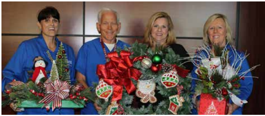
The Methodist Mansfield Medical Center's Auxiliary raising funds through their Holly Days event