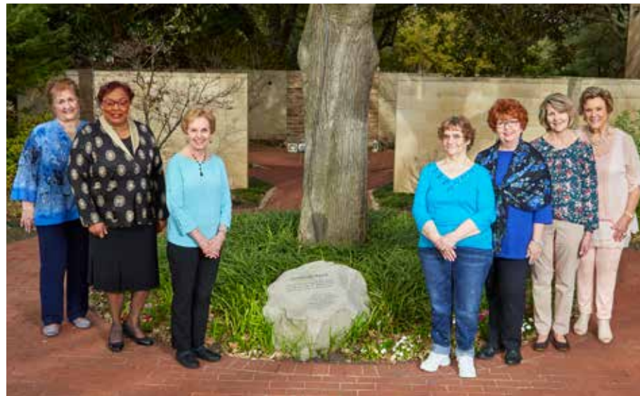
The 2019-20 Methodist Charlton Medical Center Auxiliary Board of Directors

This year they will donate the medical supplies needed for a mission trip that one of Methodist Mansfield's physicians makes every year, and the Women's Center will be getting some new equipment through Auxiliary funds. Like other Auxiliaries, they will also gift scholarship funds to hospital employees. ■