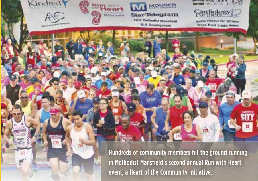
Hundreds of community members hit the ground running in Methodist Mansfield's second annual Run with Heart event, a Heart of the Community initiative.